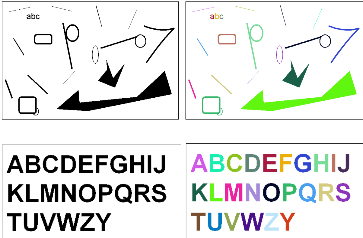
Fig. 5.4.2 Labeling examples